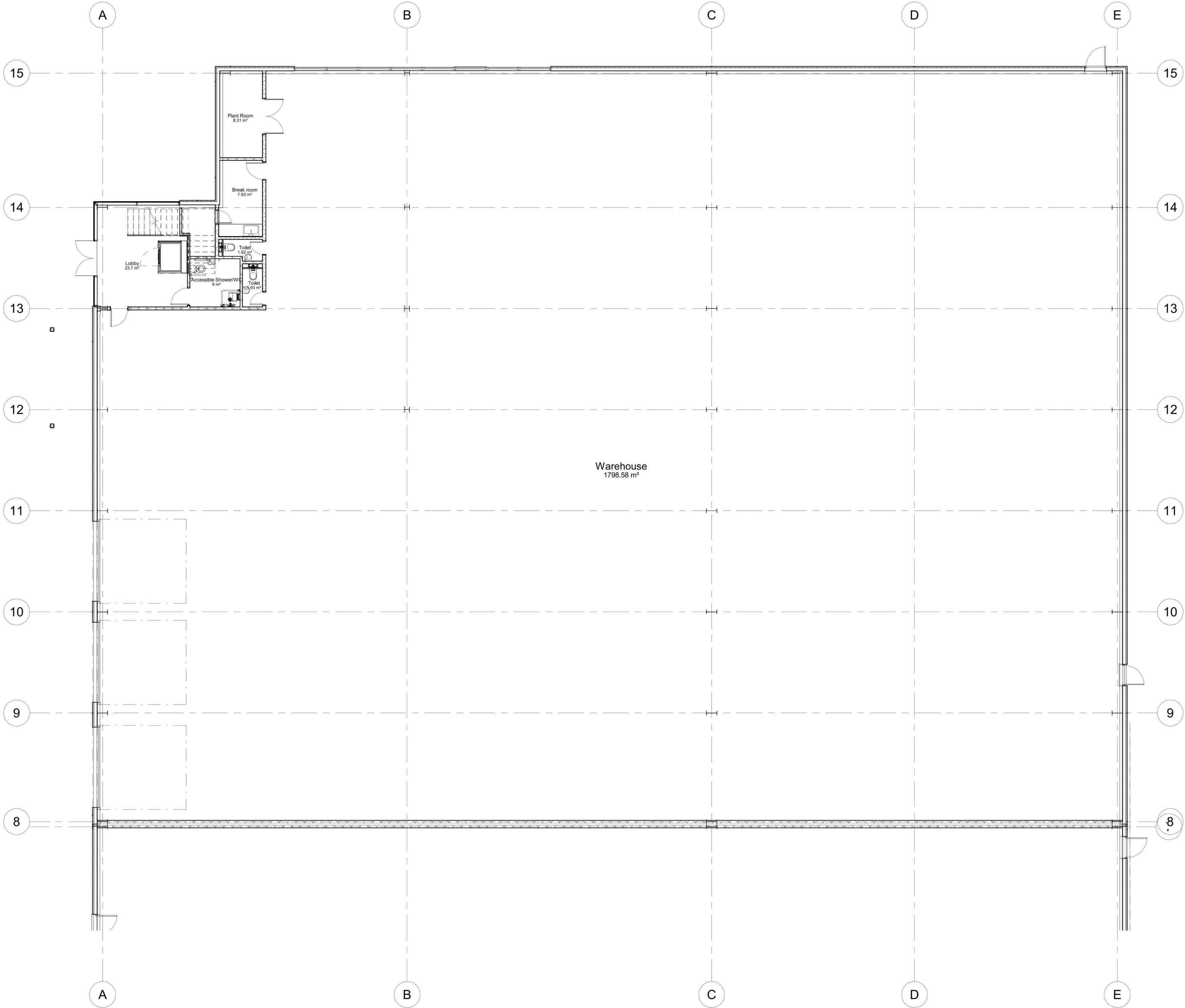
1 0 - Ground Floor Proposed 27B 1 : 100